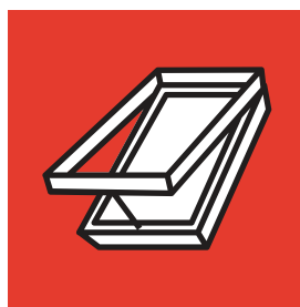
DOORS AND WINDOWS